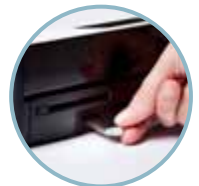
Scan to USB