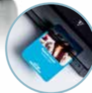
Plastic ID card slot