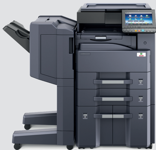
d-Copia 3201MF (or d-Copia 4001MF) + Platen Cover (E) + PF-810 + DF-7120 + AK-740