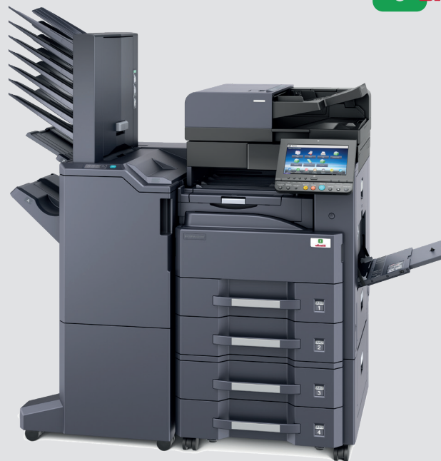
d-Copia 3201MF (or d-Copia 4001MF) + DP-7110 + PF-791 + DF-7110 + AK-740 + MT-730(B)